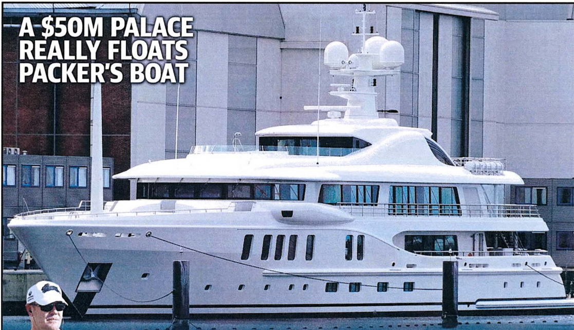
The Amels 212 Z yacht, worth more than $50m, is the new boat for James Packer; and (inset) Packer reclines on the deck of his last yacht.