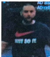
The man police are seeking.